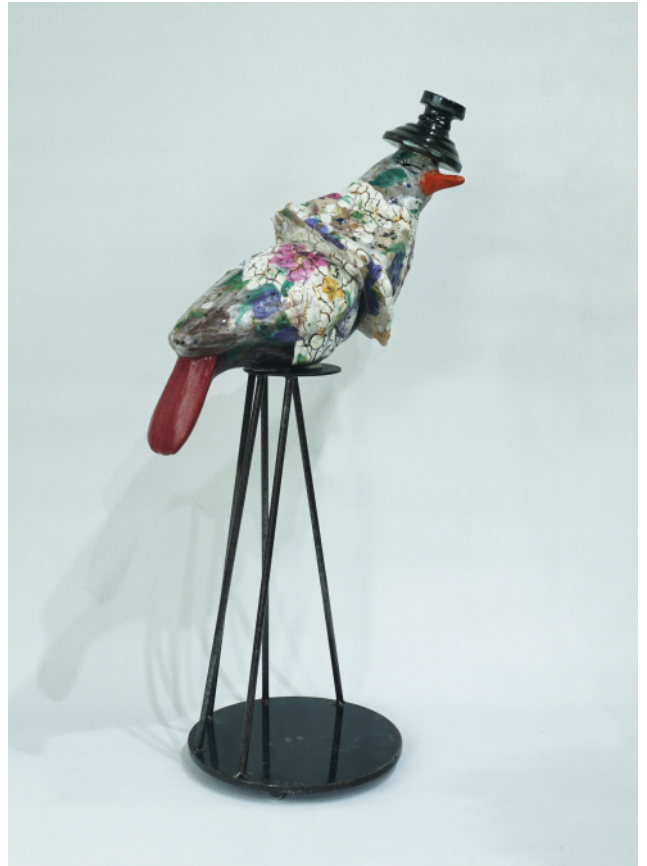
Umibaizurah Mahir@Ismail Distant Echoes 3 2023 – 2024 Ceramic, Lacquer, Steel Rod & Steel Plate 53 x 26 x 17 cm