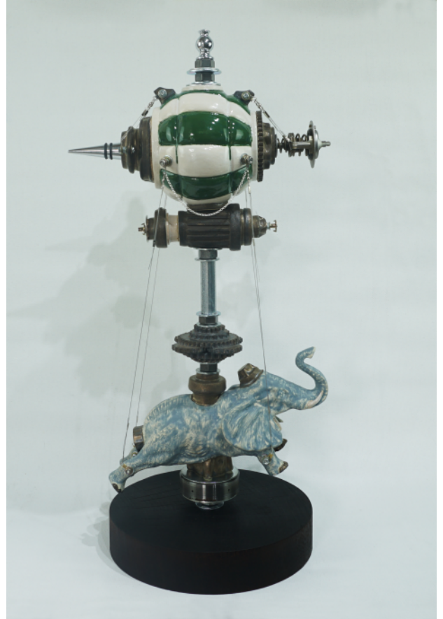
Mohd Al-Khuzairie Ali Dystopia – Flying Jumbo 2023 – 2024 Ceramic, Steel, Silver Chain, Barrel Swivel, Nuts & Bolts 63 x 31 x 25 cm