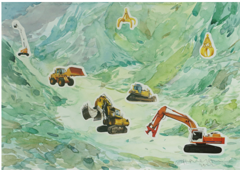
Ahmad Shukri Mohamed (1969) Premium Landed House 2 2022 Sticker, Water Colour on Paper 31 x 42 cm