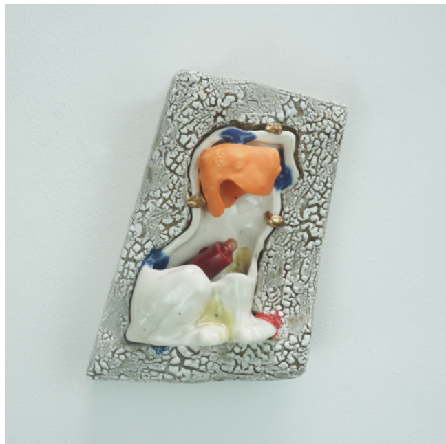
Umibaizurah Mahir@Ismail Unveiled Silence #5 2023 – 2024 Ceramic & Lacquer 20 x 13 x 9 cm