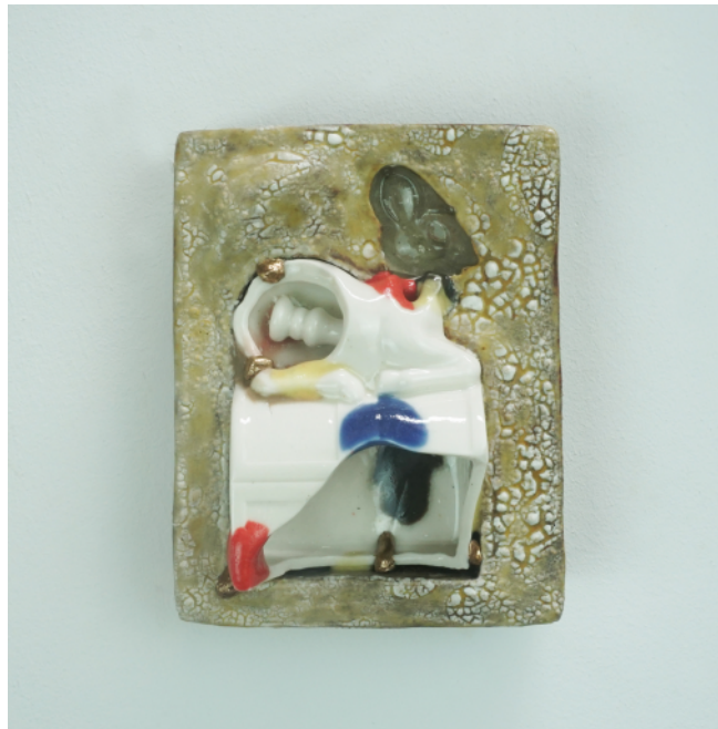
Umibaizurah Mahir@Ismail Unveiled Silence #4 2023 – 2024 Ceramic & Lacquer 19 x 15 x 8 cm