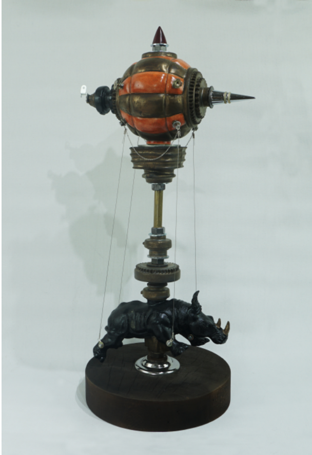
Mohd Al-Khuzairie Ali Dystopia – Flying Rhino 2023 – 2024 Ceramic, Steel, Silver Chain, Barrel Swivel, Nuts & Bolts 63 x 30 x 25 cm