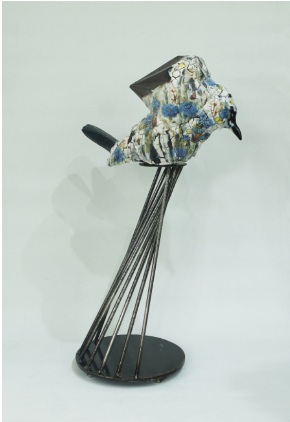
Umibaizurah Mahir@Ismail Distant Echoes 2 2023 – 2024 Ceramic, Lacquer, Steel Rod & Steel Plate 49 x 27 x 17 cm