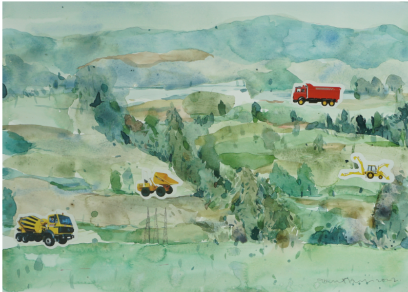
Ahmad Shukri Mohamed (1969) Premium Landed House 1 2022 Sticker, Water Colour on Paper 31 x 42 cm