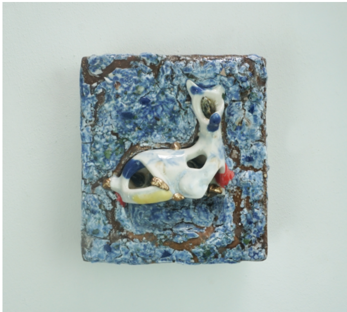
Umibaizurah Mahir@Ismail Unveiled Silence #2 2023 – 2024 Ceramic & Lacquer 19 x 17 x 10 cm