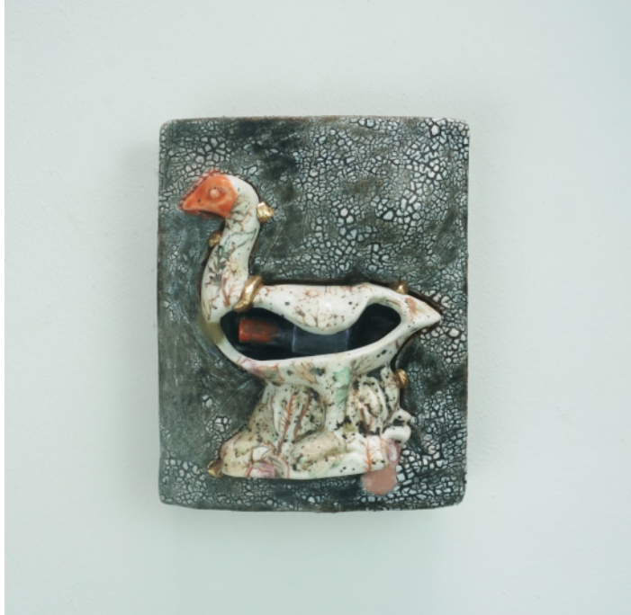
Umibaizurah Mahir@Ismail Unveiled Silence #3 2023 – 2024 Ceramic & Lacquer 19 x 15 x 9 cm